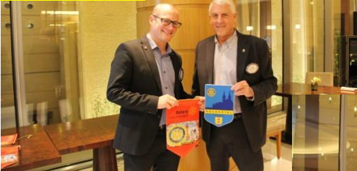
Banner exchange with the RC Neuchâtel